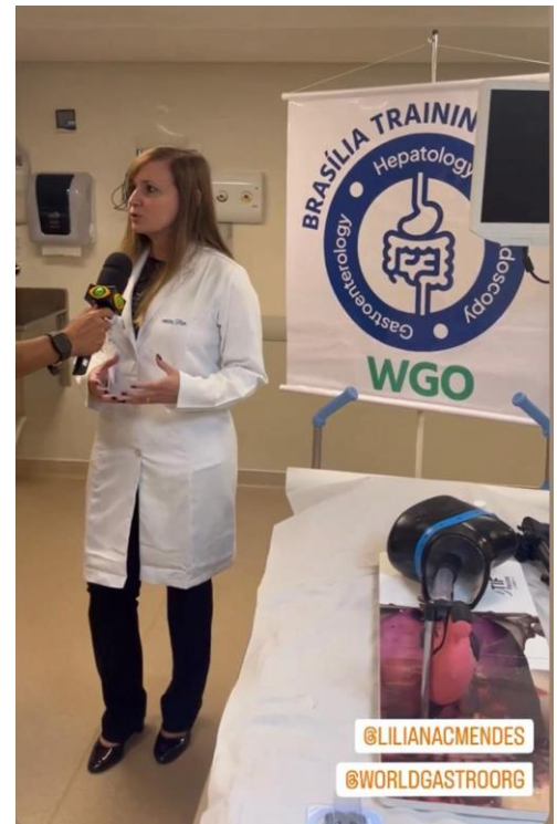
BrasiliaTraining Center: Training at Santa Helena Rede D'Or Brasilia Hospital on September 30 th , 2023.