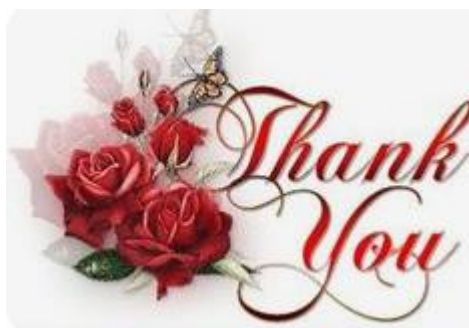
For stopping by WGO's booth

In addition, the Chair of the Training Centers visited WGO's booth at UEG in Copenhagen from October 14 th - 17 th :