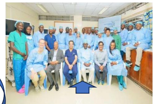
All delegates and faculty after a Successful colonoscopy basic and advanced training.