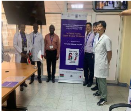
Japanese Government collaboration training

The third event training at the endoscopy unit was a collaboration with the Japanese Government through the Olympus team both internationally and locally. The training aimed to improve gastrointestinal disease evaluation in Kenya by building capacity.