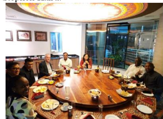
Perfect dinner after a successful conference.