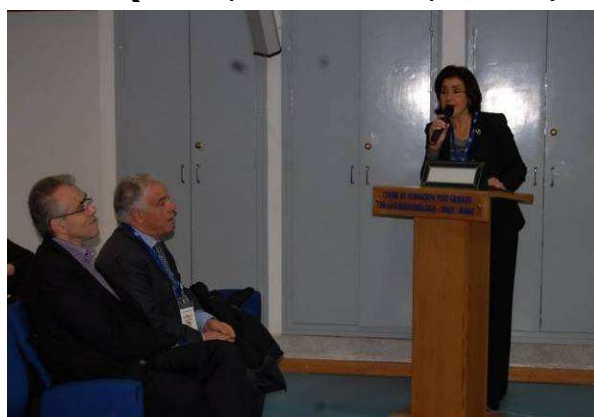
From left to right: The Director of Ibn Sina Hospital, the Past President of WGO, the Vice President of University Mohammed5 Souissi –Rabat and the Director of WGO-RTC