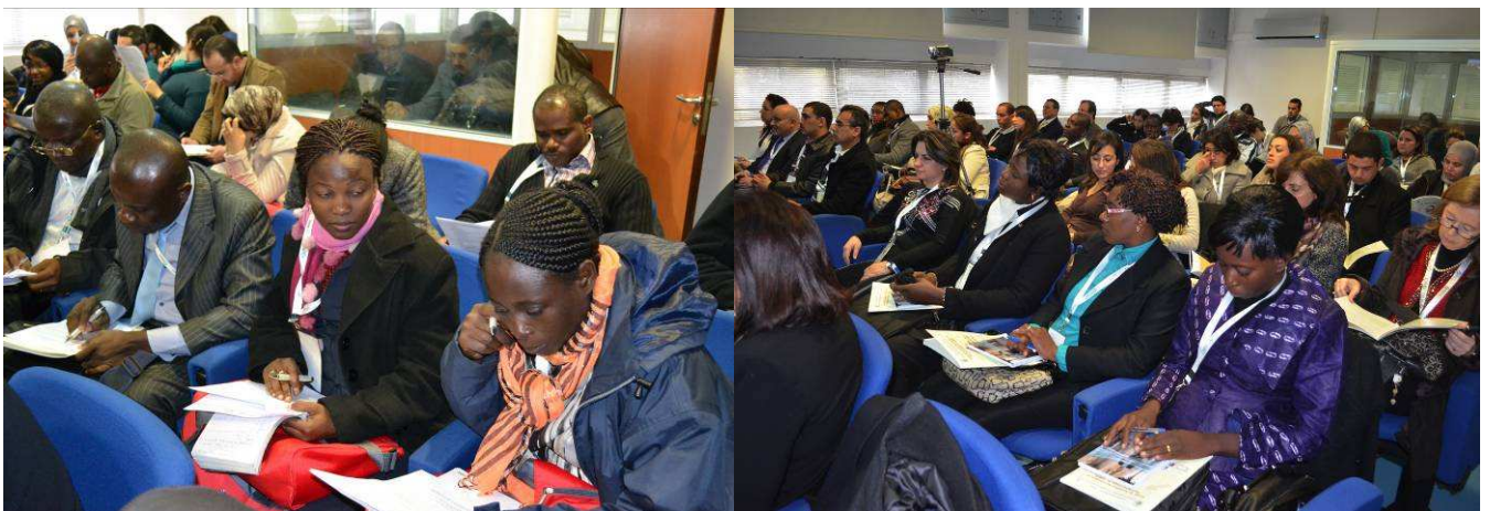
Evaluation of the Annual Course

At the end of each annual course, all participants are invited to answer a course evaluation form. The winners are the first and second in the standings. They earn a scholarship enabling them to attend the next annual course of the Centre for free.