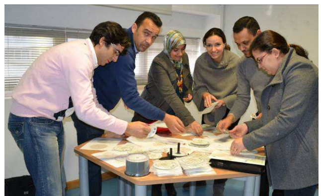
WGO-RTC Team preparing DVD & related documents