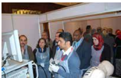
Attendees take part in hands on training at the 16th Egyptian Workshop of Therapeutic GI Endoscopy and 7th Hepatology and Gastroenterology Post Graduate Course.

gastronomic attractions of Cairo are easily accessible. All participants were active and enthusiastic contributors to our events. Joining forces ensured that it was the best educational event