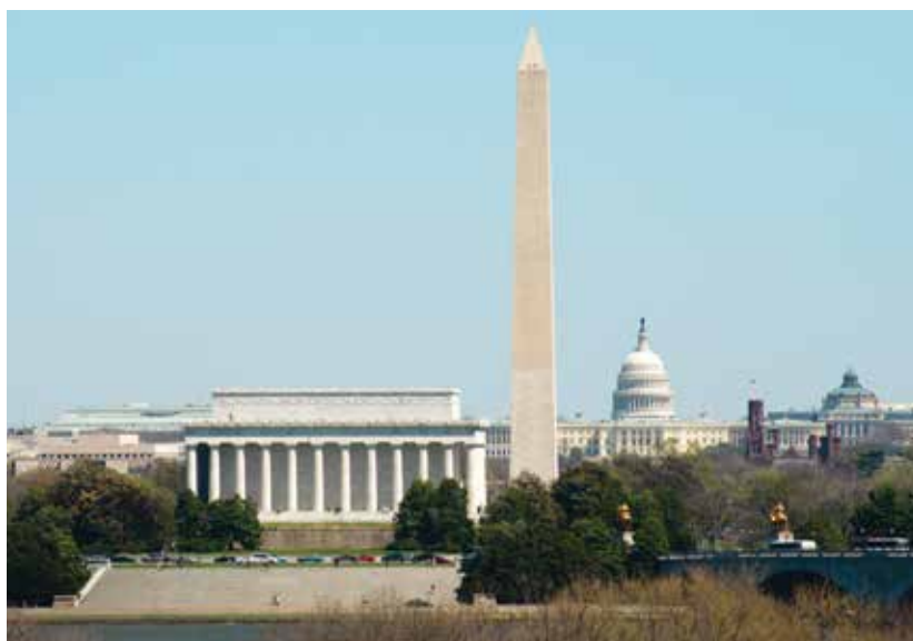
Visit us at booth 3142 during DDW 2015 in Washington, DC, USA!

We are delighted to announce that the 2015 General Assembly Meeting will be held during Gastro 2015: AGW/WGO in Brisbane, Australia. While the time and date of the meeting is in the process of being finalized, please be reminded that at the time of the General Assembly, only Member Societies who have fully paid their dues through 2014 may participate with full voting privileges. If you are unsure of your society's membership status, please contact the WGO Executive Secretariat at membership@worldgastroenterology.org .