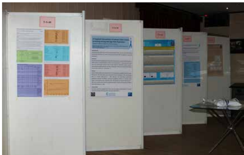
Posters at the Iranian Congress of Gastroenterology and Hepatology.