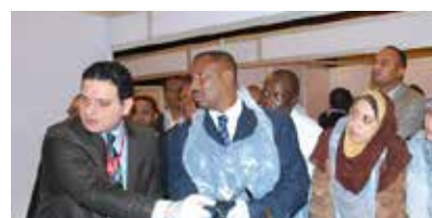
Attendees take part in hands on training at the 16th Egyptian Workshop of Therapeutic GI Endoscopy and 7th Hepatology and Gastroenterology Post Graduate Course.

eminent experts from all over the world. On Saturday 13 December, live endoscopy was video broadcast from the Air Force Specialized Hospital in Cairo, Egypt and on Sunday 14 December, live endoscopy was video broadcast from Al Rajhy Hospital, Assiut University in Assiut, Egypt to the auditorium in the congress venue, the Conrad Cairo Hotel.