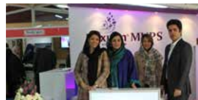
Attendees visit the Exhibition Hall at the Iranian Congress of Gastroenterology and Hepatology.

Speakers are carefully selected from Iranian and international scientists. 2014 had nine invited lecturers from the USA and France, whose lectures helped improve the quality of the congress and postgraduate course. Sessions were held in two halls simultaneously and most sessions included an open-discussion panel in which important points were discussed with participants. The hottest topics at ICGH were probably the new treatments of hepatitis C and the role of microbiota in various diseases.