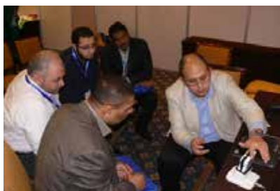
Attendees take part in hands on training at the 16th Egyptian Workshop of Therapeutic GI Endoscopy and 7th Hepatology and Gastroenterology Post Graduate Course.

The joint event was endorsed by prestigious international societies: the 16th Egyptian Workshop of Thera-