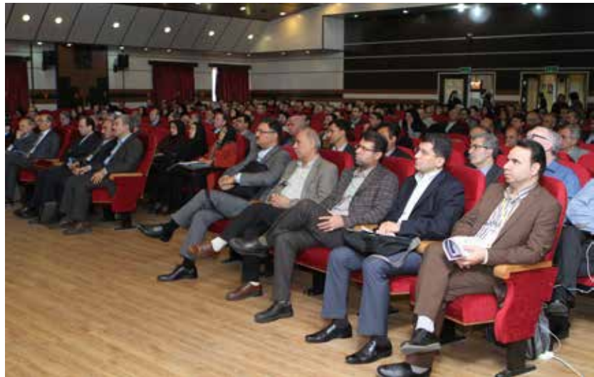
Participants in Hall A of the Iranian Congress of Gastroenterology and Hepatology.

As the ICGH is arguably the only time when most members of the association (IAGH) from all over the country gather, there are usually a few business-related meetings that discuss new regulations and insurance or tax issues. Also prominent members of IAGH in the preceding year are selected and acknowledged ( http://iagh.org/portal.aspx?tabid=185 ):