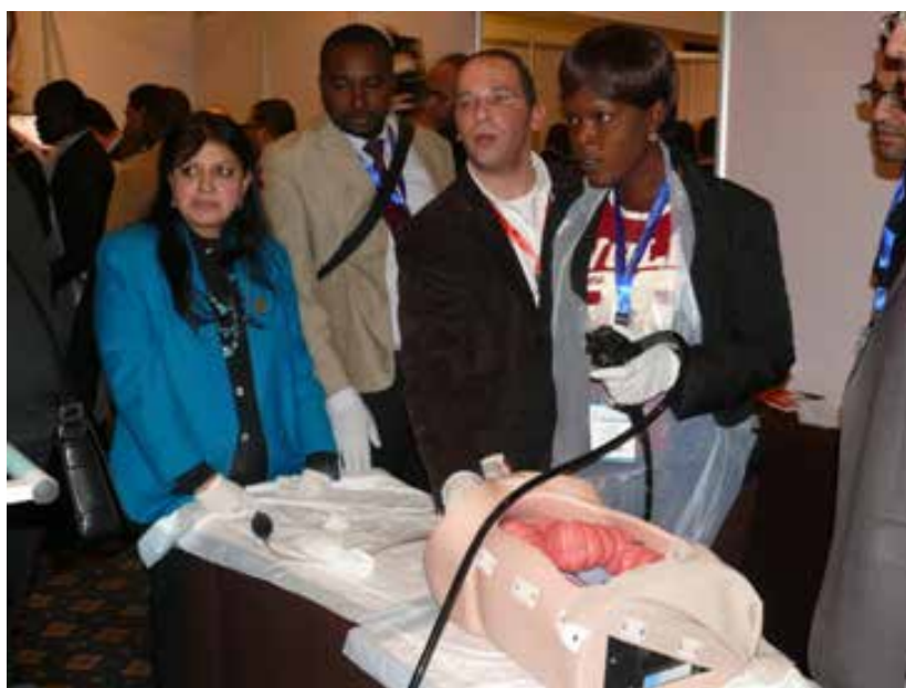
Attendees take part in hands on training at the 16th Egyptian Workshop of Therapeutic GI Endoscopy and 7th Hepatology and Gastroenterology Post Graduate Course.