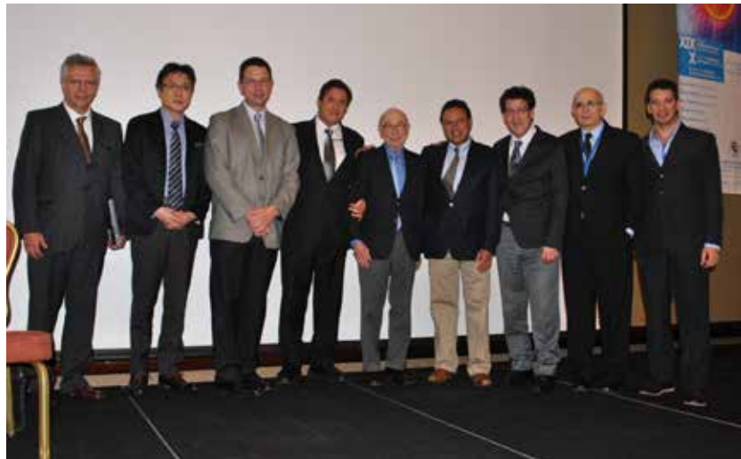
International faculty during the XIX Gastroenterology and Digestive Endoscopy Course in Bogotá.