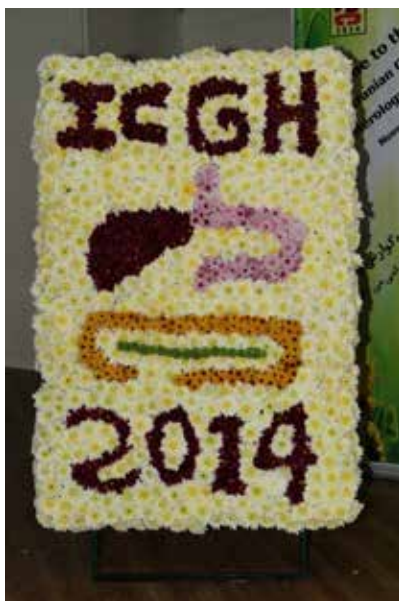
The Iranian Congress of Gastroenterology and Hepatology logo in flowers.

The congress covers all topics related to gastroenterology and hepatology, especially new lines of research and future trends. The ICGH consists of a single-day postgraduate course followed by three days of congress sessions. Workshops are also held during the ICGH, usually endoscopy techniques, but occasionally non-