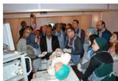
Attendees take part in hands on training at the 16th Egyptian Workshop of Therapeutic GI Endoscopy and 7th Hepatology and Gastroenterology Post Graduate Course.

The live Therapeutic Endoscopy Workshop is an event eagerly awaited by the attendees every year. It allows the audience to view the most recent endoscopic diagnostic and therapeutic procedures, as well as learn how to deal in difficult situations, with