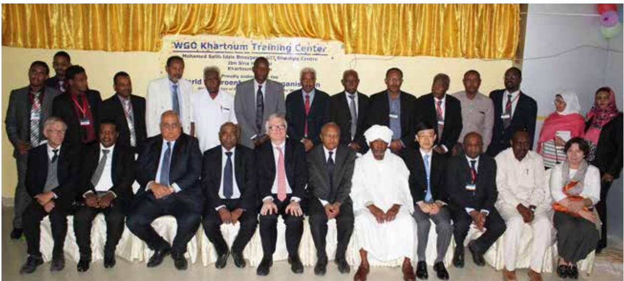
Attendees at the Training Center Inauguration.