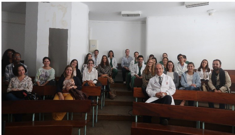
WGO Training Center in Porto celebrated the 10 th edition of the Clinical Hepatology Preceptorship.

These have been ten wonderful years navigating hepatology, teaching, discussing and learning many of the tips and tricks of the fascinating world of liver diseases. Everyone feels grateful for what we have been achieving in these educational events, and the great feedback from the participants is a fulfilling and wonderful measure of success. More to come over the next years in hepatology, right from the heart of WGO Gastroenterology and Hepatology Training Center in Porto, stay tuned!