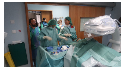
Participants and faculty engaging in hands-on learning.